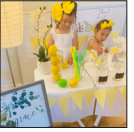
Crisis Increases Need for Mental Health