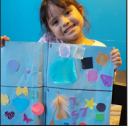
Fun Focus on Development