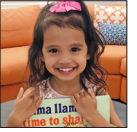
Your Support Changes Lives