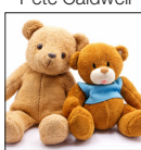
Foster Placement Becomes Forever Home