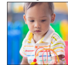
Advocacy Corner Page 4