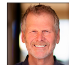
Executive Director Message Page 2